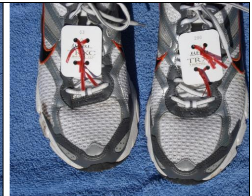
Twist Ties To Secure Chip To Shoe

BIBS MUST BE PINNED TO THE FRONT AND BACK OF THE RUNNER. THERE ARE 2 HIP NUMBERS FOR EACH ATHLETE INCLUDED IN YOUR PACKET. PLEASE PLACE THESE ON EACH SIDE OF YOUR HIP AS TO HELP WITH VERIFICATION AND BACKUP OF THE FINISHLYNX CAMERA.