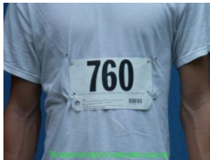
Proper Front Bib Number Placement

You must wear your IPICO Sports Tag (CHIP) to receive your Finishing Time and Place (Please place a chip on each shoe). If you do not wear your CHIP we will be unable to give you the correct place or time. The system will record your time and place but all finishers are verified with a Finishlynx camera for close finishes. CHIPS will be returned by coaches. ($50 for each unreturned chip will be charged to the school).