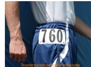
Proper Hip Number Placement

Your BIB number is marked on the chip. Please make sure you put the correct CHIP on your shoe in the manner shown below. It does not matter which side of the chip is facing up. The chip may also be tied into your laces of your shoe if you wish, as a extra precaution use a twist tie in conjunction with this method.