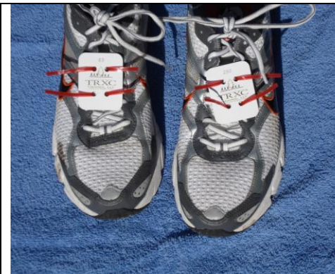
Insert Twist Ties Into Holes On Chips