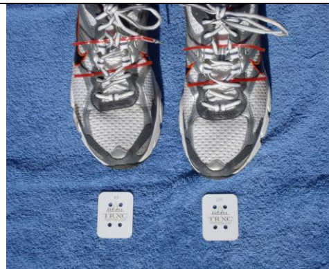
Insert Twist Ties into Laces